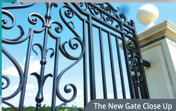
The New Gate Close Up