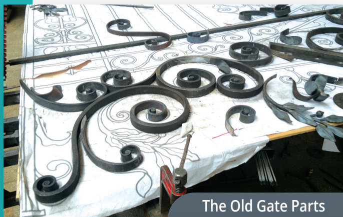
The Old Gate Parts