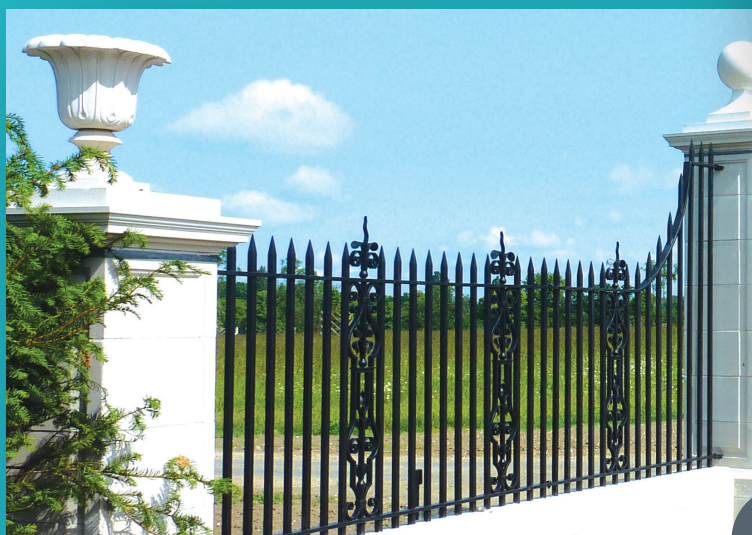
The new gates and railings adorning the estate today